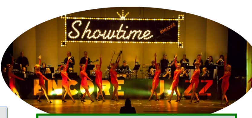
The Fabulous "SHOWTIME—ENCORE" Dancers and Jazz Ensemble