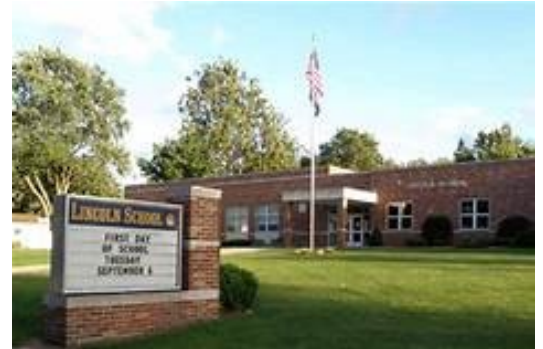
Current Lincoln Elementary School