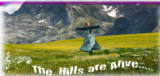
The Hills are Alive....