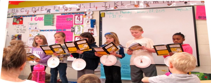
E.P. Clarke Interactive Learning