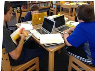
Computers at Upton

A teacher's task, regarding creativity is to help young people climb their own mountains, as high as possible