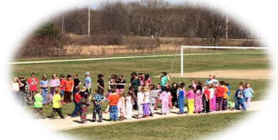
Fire Drill at Brown

Which picture did your participation in ENCORE not help the Foundation support?