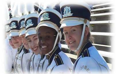
Band at SJHS

Good teaching is 1/4 preparation is 3/4 theater.