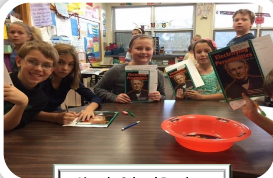
Lincoln School Readers

Teachers affect eternity; no one can tell where their influence stops!