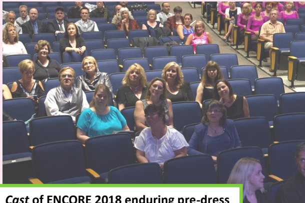
Cast of ENCORE 2018 enduring pre-dress rehearsal speech